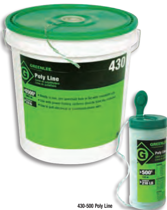
430-500 Poly Line