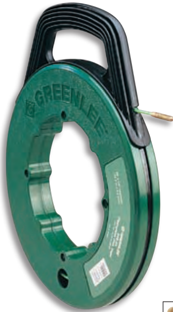
540-50, 540-100 (12" Case)