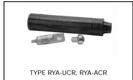
TYPE RYA-UCR, RYA-ACR