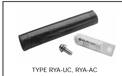
TYPE RYA-UC, RYA-AC

The kit consists of: Universal HYLUG™, mounting hardware and heat-shrink sleeve. The HYLUG™ is pre-filled with PENETROX™ joint compound and sealed. Installed with common installation tools, three die sets install a range of 4 str.- 350 kcmil. The heat-shrink sleeve is lined with a mastic material, providing a positive seal. Installed with standard propane torch, or 500°F electric heat gun. Acetylene heat is too intense and is not recommended.