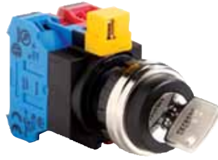
3-Position Key Switches