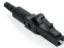
FastCAM LC OM2 Connector