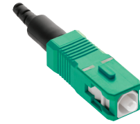
FastCAM SC/APC OS2 Connector