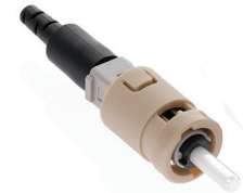
FastCAM ST OM1 Connector