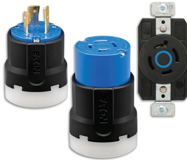
Photography is for reference only.