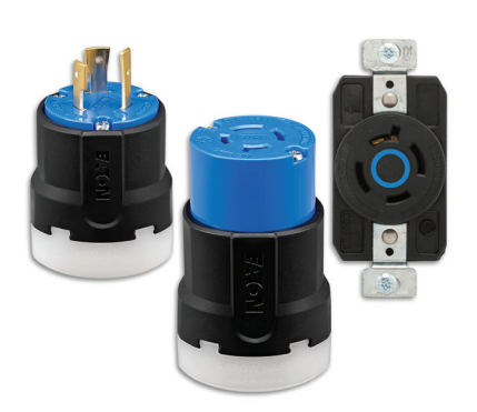
Photography is for reference only.