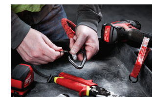
Quick Tool Change Out