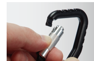
Double Locking Carabiner