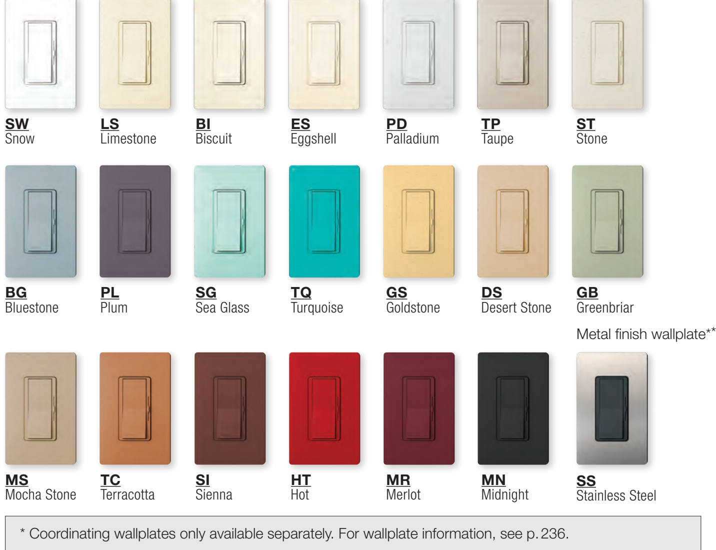
Satin Colors® finishes*

** Stainless Steel wallplate only available separately and includes black plastic trim/adapter, visible from side. Match with separate Black (BL) or Midnight (MN) controls. For wallplate information, see p.236