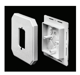
8082F (for 1/2" or less)