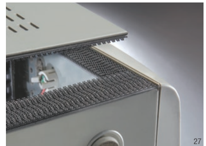
Attach access panels to industrial, electronic and electrical equipment. 27