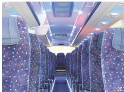
Fasten ceiling panels to interior for future access. 268