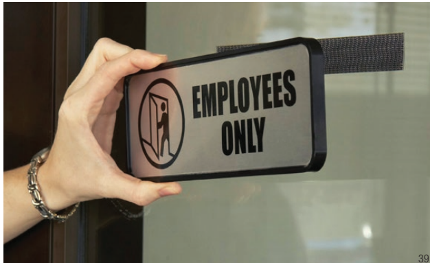
Secure plastic signs to window glass. 39