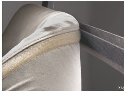
Attach removable seat cushions.