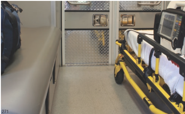
Attach cushioning panels in an ambulance or bus.