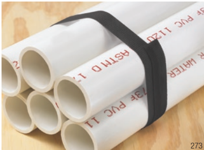
Use as a replacement for string, tapes, rubber bands, wire and strapping.