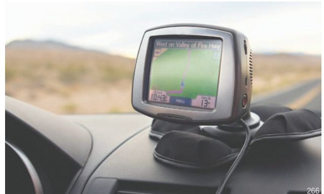
Anchor vehicle accessories to dashboard. 266