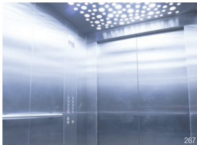
Attach elevator control panel to interior wall. 267