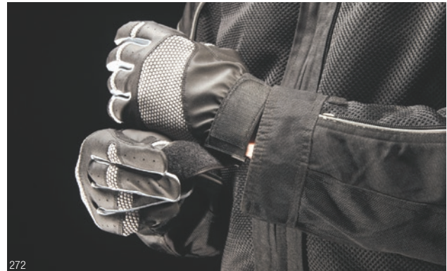
Sew to the fabric and leather of jackets and gloves.