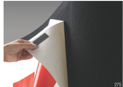
Hang graphics and banners that change frequently.