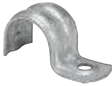
CI1304 / CI1316