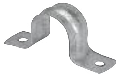
CI1404 / CI1416