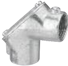
-G: with gasket