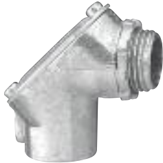
Zinc Die Cast Locknut