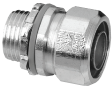
IT: with insulated throat