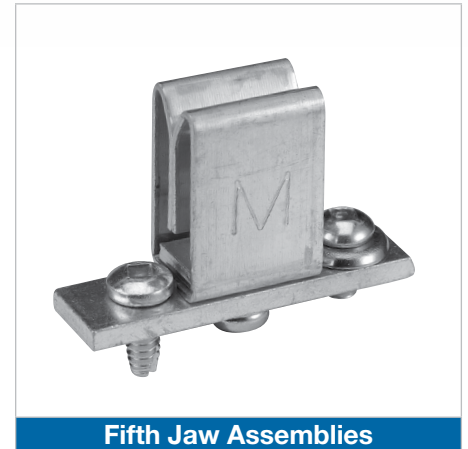
Fifth Jaw Assemblies

* CSA not applicable † For mono blocks only