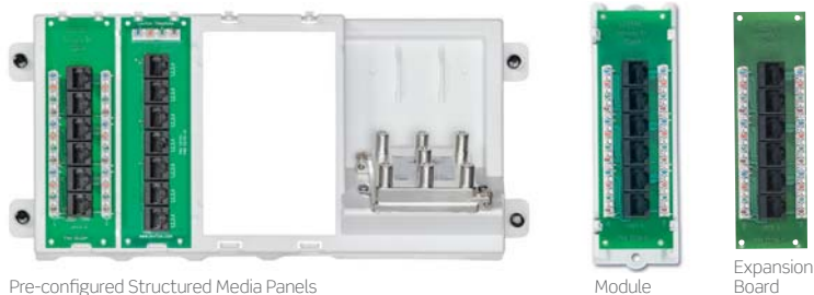
Pre-configured Structured Media Panels

Expansion Boards mount in Structured Media Panels or Mounting Brackets (see page H13).