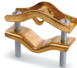
3844 For armored and unarmored wire