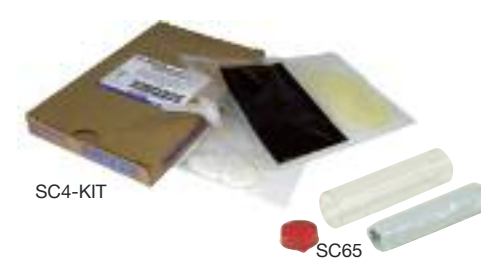
For more details, refer to the installation/instruction sheet.

The Canadian Electrical Code states that tray cable in hazardous locations can be used either within the cable tray, or outside the tray - provided there is additional protection. The Tray Star™ fitting was designed and engineered for either application and comes complete with the bushing, ground cone and sealing ring for different product applications.