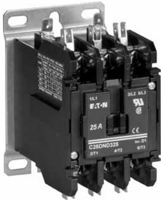
15–360A, Two-, Three- and Four-Pole—C25