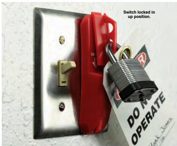
Switch locked in up position.