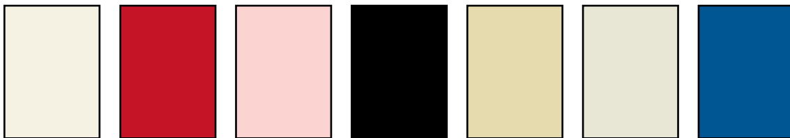
Primer Red Pink Flat Black Ivory Light Almond Blue

To order custom metal wall plates, see Pages P-41 – P-45.