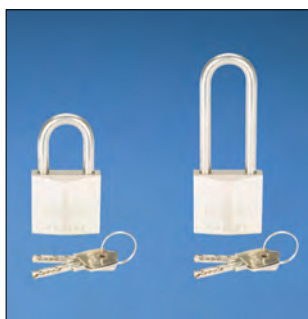
PSL-9 and PSL-9-LS

Harsh environment padlocks are created with a solid brass body with a chrome finish and stainless steel shackle for use in severe weather and environmental conditions. Flexible shackle padlocks allow movement of the lock body in order to close the panel door