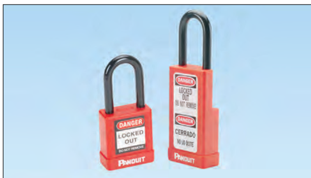
PSL-8 and PSL-8-LB

Aluminum body and shackle with non-conductive vinyl cover delivers protection against electrical hazards for maximum safety, specifically in lockout/tagout applications. Padlock is available with the standard 1.77" body or 3.00" long body design that allows safety message to be displayed on the padlocks in two languages.