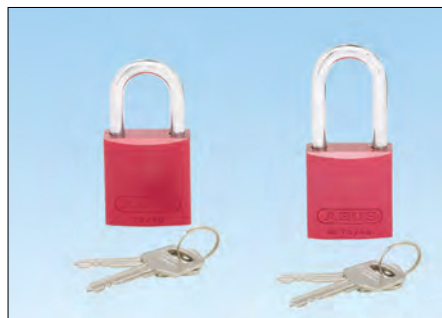
PSL-7 and PSL-7-LS