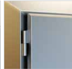
External lift-off hinge (not hidden) allows for quick thorough cleaning