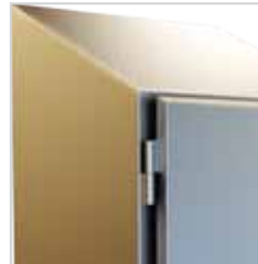
25 degree sloped top – quickly sheds water during wash-down