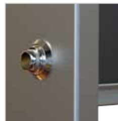
Easy to clean no-crevice quarter turn latches – ultimate in easy to clean design