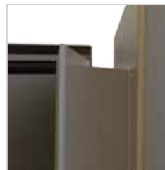
“V” formed body flange channels water away and provides additional gasket protection during pressure wash processes.