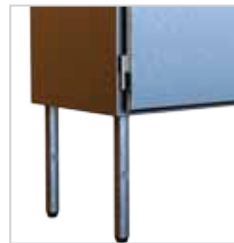
Easy to clean floor stand kits – fixed height or with adjustment for levelling