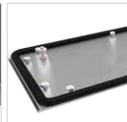
Certified standard & special sized gland plates – maintain Type approvals at any location