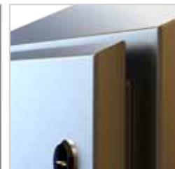
Top/bottom door edges sloped to shed water effectively. Gap between door edges and body provide superior access for flange cleaning.