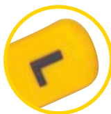
Smart-Grip™ Dual Durometer Molded