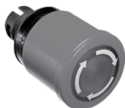
Emergency stop, twist release illuminated, Ø 40 mm