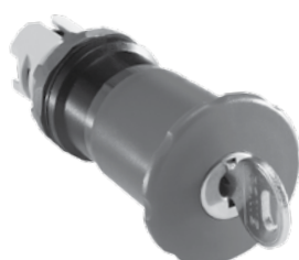
Emergency stop, key release, non-illuminated, Ø 40 mm