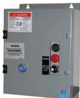
NEMA Type 12/3R

For customers looking for an integrated and convenient cover control design, Eaton offers our standard 22mm kit designs. These kits allow simple removal of the front enclosure cover (no plug connections to remove) and can accommodate our traditional design. These operator interface kit assemblies make use of the M22 series of selector switches, pushbuttons, LED pilot lights, providing greater versatility for control and indication.