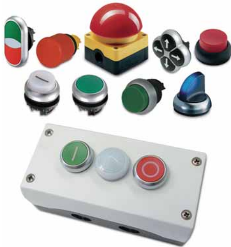
22.5 mm Modular Pushbuttons—M22