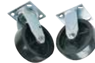
Optional casters available for increased mobility. See page 427 for options