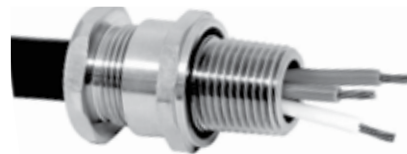
Dimensions in Millimeters (Inches)