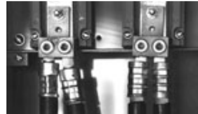
Lug Will Not Accept Straight Pin Offset Pin Design - Application