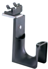
JP2HBC25RB-L20 JP2HBC50RB-L20 JP2HBC75RB-L20