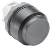
Illuminated extended push- button with black plastic bezel