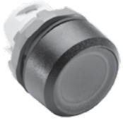
Illuminated flush pushbutton with black plastic bezel