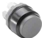
Non-illuminated extended pushbutton with black plastic bezel