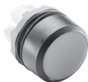
Non-illuminated flush pushbutton with black plastic bezel