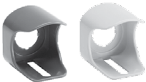
Shroud for emergency stop