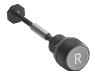
Reset pushbutton with shaft marked "R"