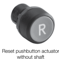
Reset pushbutton actuator without shaft