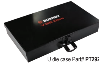
U die case Part# PT29291, holds up to 15 dies