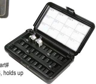
W die case Part# CASEWDIES, holds up to 24 dies