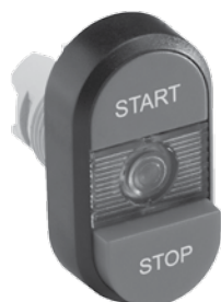
Double pushbutton with extended lower button, illuminated Lens color: Red, green, yellow, clear

NOTE: No contact block in center position, reserved for LED/lamp block For contact blocks, holders & LED lamp blocks, see Accessories pages 7.25 - 7.30.