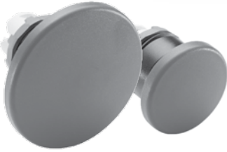
Mushroom pushbuttons, non-illuminated