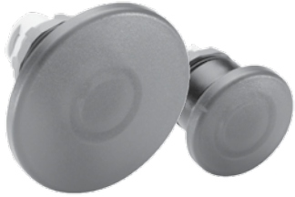
Mushroom pushbuttons, illuminated