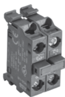
Double contact block