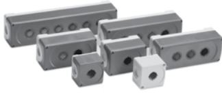
Empty enclosures 1-seat - 6-seat