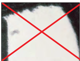
Other manufacturer's tie body

The Pan-Steel® Stainless Steel Cable Tie features fully rounded edges to assure bundle protection and operator safety. Panduit not only removes the burr, but actually passes the material through a secondary process which removes the top and bottom corners of the material.