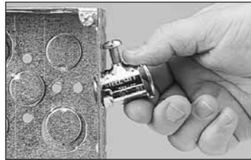
1. Simply snap into place. No locknuts required!