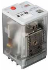
D5 Series Relay