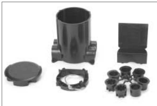
The Ratchet-Pro PVC Floor Box provides power and communication to open-space areas.

T he Walker Ratchet-Pro PVC Floor Box provides dual-service capability in a single, easy-to-install round floor box. This design allows the flexibility of providing power and communications to open-space areas in one aesthetic package. Applications include malls, shopping centers, department stores, airports, hospitals, and office buildings. This box is UL/cUL Listed for both grade and above grade concrete construction.