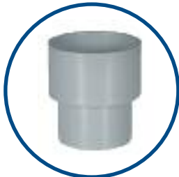
Coupling E910 Series