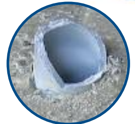
Broken conduit on jobsite