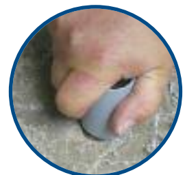
Rotate 1/4 turn.