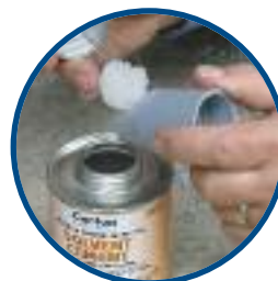
Apply a uniform coat of cement.

5. Insert the coupling and cement into place using the cement manufacturer's instructions.