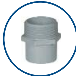
Male Threaded Adapter E920 Series