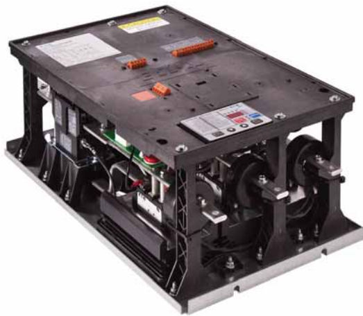
Type S611, Soft Starter