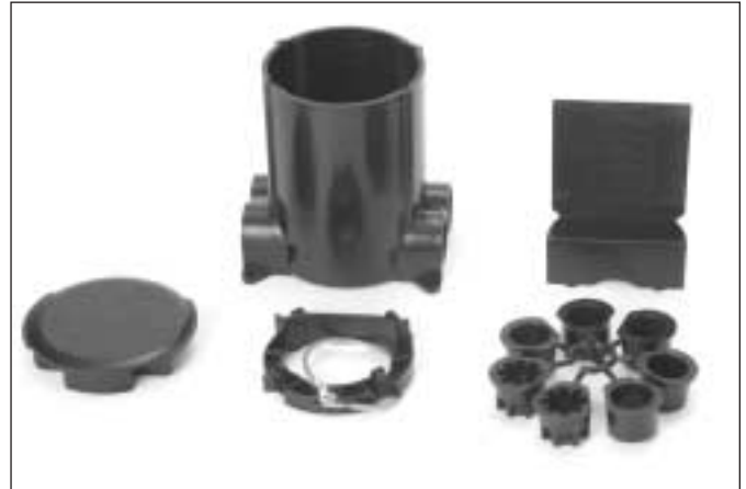
The Ratchet-Pro PVC Floor Box provides power and communication to open-space areas.

The Walker Ratchet-Pro PVC Floor Box provides dual-service capability in a single, easy-to-install round floor box. This design allows the flexibility of providing power and communications to open-space areas in one aesthetic package. Applications include malls, shopping centers, department stores, airports, hospitals, and office buildings. This box is UL/cUL Listed for both grade and above grade concrete construction.