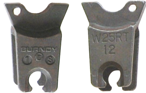
W25RT Die Set

Die Sets sold separately; W Die Kits also available; see following page