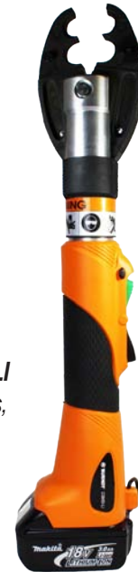
Shown: CSMD6-LI Scissor-action jaws, safety orange