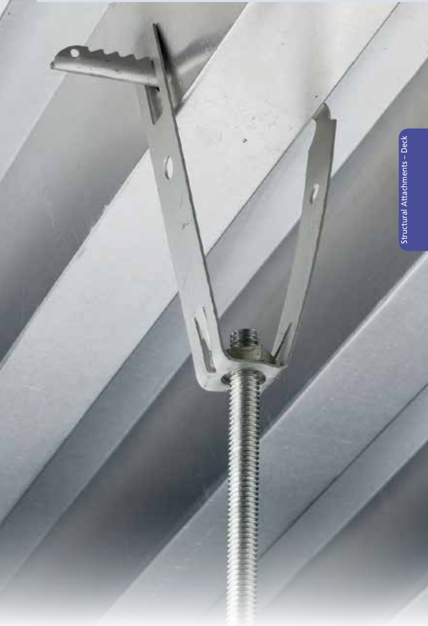
Structural Attachments – Deck