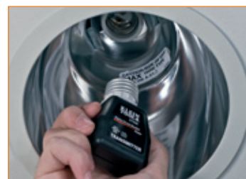
Light Socket Adapter

Designed by Electricians for Electricians