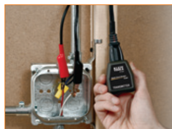
Alligator Clip Accessory